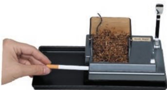
4. Insert empty cigarette tube