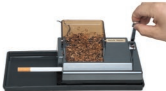
5. Press the lever fully down to inject the cigarette