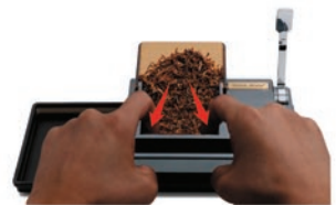
Notes: To fill 100mm tube, Please fill corners first.