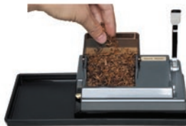
2. Lift the lever and open the lid, Fill in tobacco