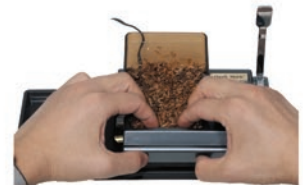
3. Slightly press tobacco