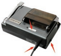
1. Plug in power and display light on